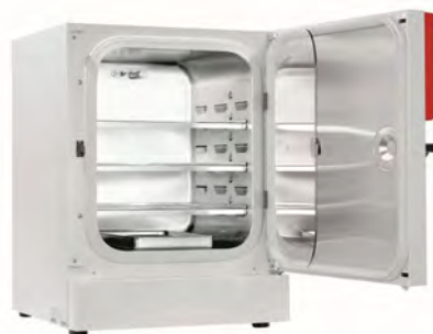
▲ CO 2 -incubator CB 150